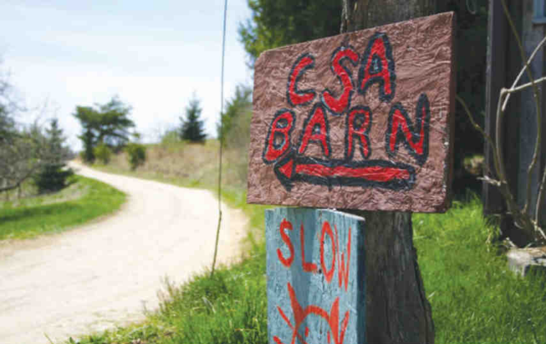
On the farm, it's all pretty simple, including directions