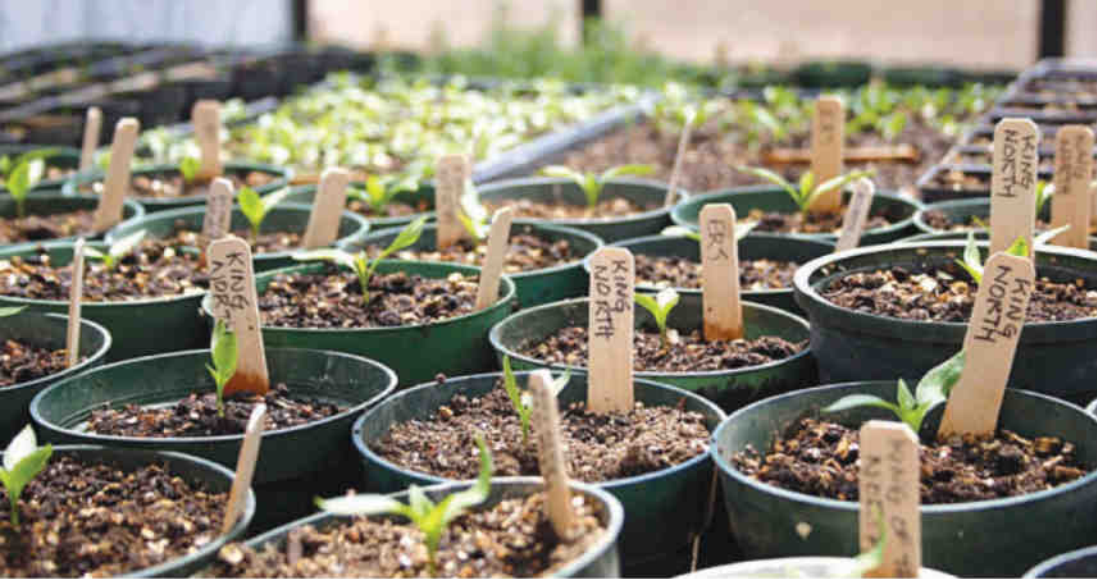
Seedlings push through in their pots